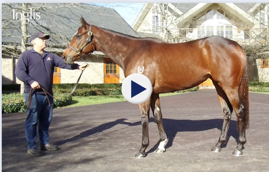
The above is a good example of a parade video