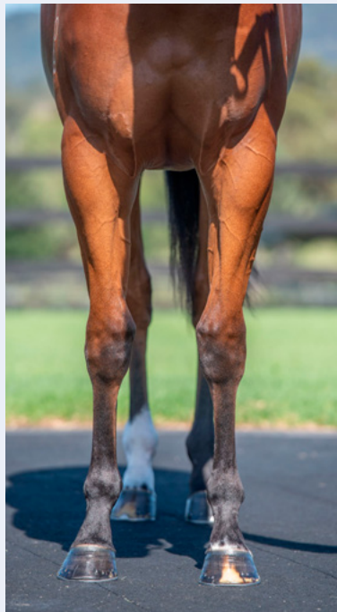
Front View Conformation