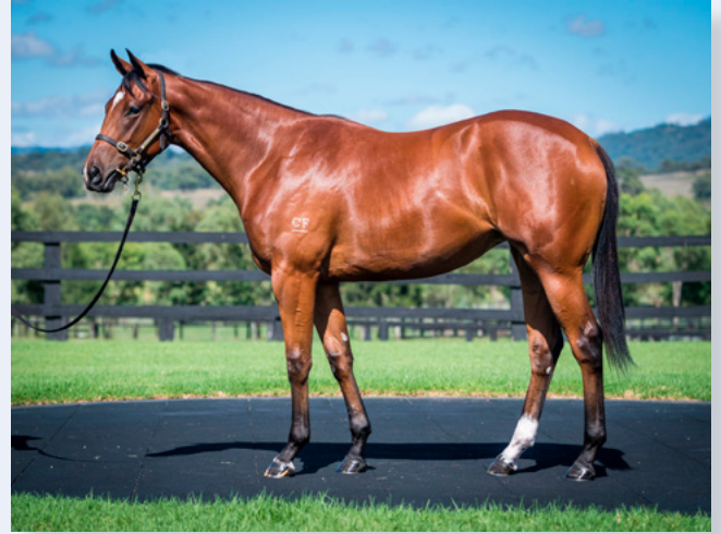
Conformation Near Side