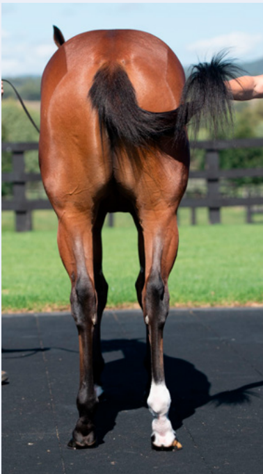
Rear View Conformation